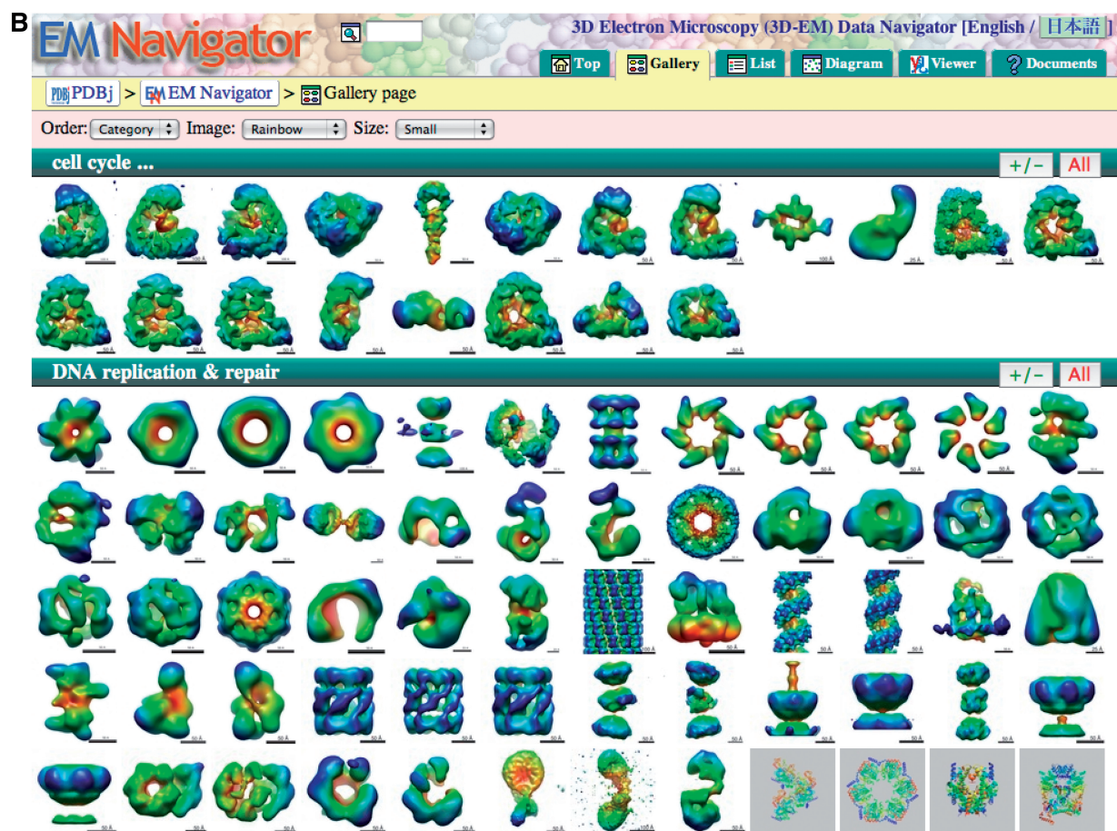
Figure 3. Yorodumi and EM Navigator. (A) Yorodumi displaying an EMDB-PDB hybrid data, EMDB-5168 and PDB 3MFP (helical assembly) (40). (B) EM Navigator gallery page.