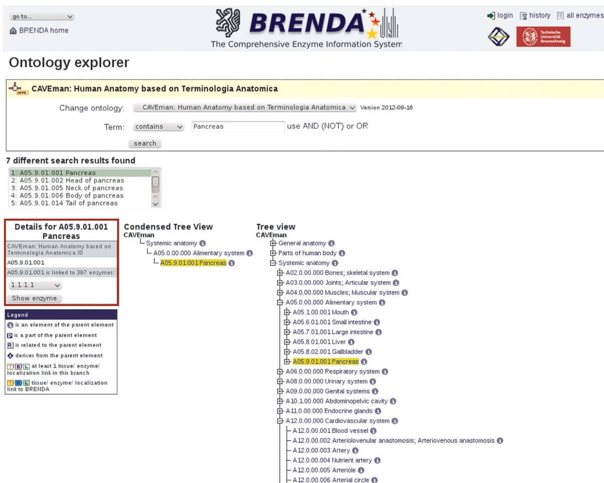
Figure 4. CAVEman human anatomy linked to enzyme data.

Since 2011 the BRENDA website gives access to BKM-react (Biochemical Reactions Aligned), an integrated and non-redundant biochemical reactions database. Since the publication of the original paper the number of reactions increased by about 20%. It contains now 21 665 unique enzyme-catalyzed reactions on natural substrates i.e. twice as much as any of the three integrated databases. Out of the 67 000 full reactions stored in BRENDA only those were included where the reactions were described in the paper to occur in a certain organism.